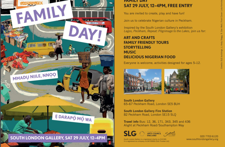
Please note that the school circulates information on clubs and events from external providers from time to time. These are for information purposes and no recommendation is given or implied.