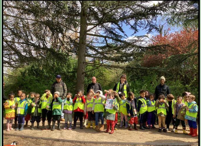
St Joseph reception class started forest school in Dulwich Park this week: the trees look huge!