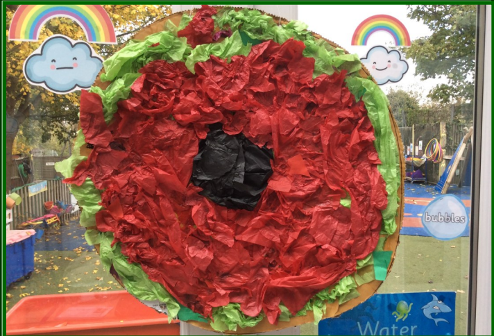
Nursery children have made a beautiful poppy to mark Remembrance Day this year.